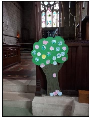
Children helped decorate our Churches for Harvest. A tractor at Hawkley and an apple tree at Greatham.